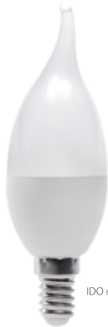
IDO 6,5W T SMD E14