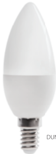
DUN 6,5W T SMD E14