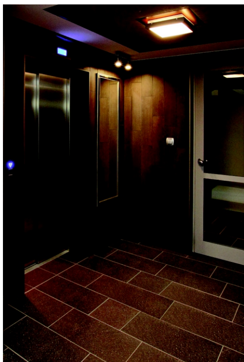
TYBIA LED 38W-NW